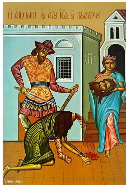
Beheading of John the Baptist

Monday 6:00am Jesus Prayer 6:00pm Vespers Beheading of John the Baptist