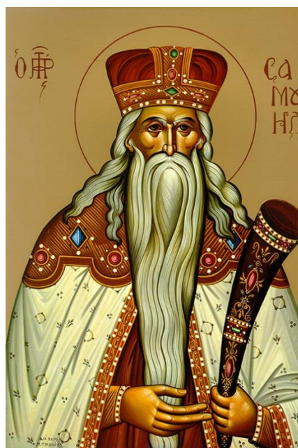
THE PROFIT SAMUEL

Monday 6:00am Jesus Prayer 7:00am Morning Prayer preceded by Confession 4:00pm Evening Prayer followed by Confession Tuesday 6:00am Jesus Prayer 7:00am Morning Prayer followed by Confession Wednesday 6:00am Jesus Prayer