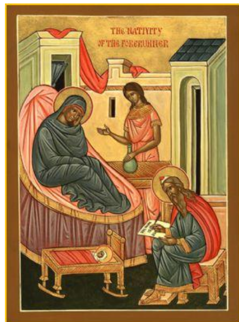
Birth of John the Forerunner

Confessions: 15 minutes before each Liturgy or by appointment