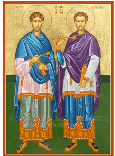
Saints Cosmas and Damian

Confessions: 15 minutes before each Liturgy or by appointment