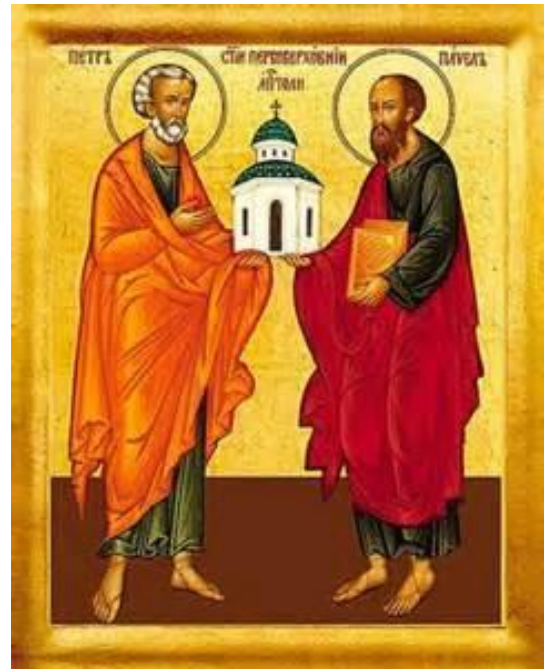
Saints Peter and Paul

Confessions: 15 minutes before each Liturgy or by appointment