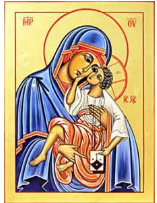
Our Lady of Mount Carmel

Confessions: 15 minutes before each Liturgy or by appointment